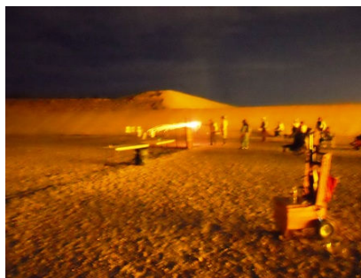
June 11, 2011 Night Shoot